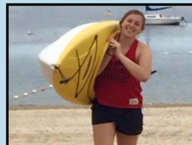
Slice of Life (p.4)