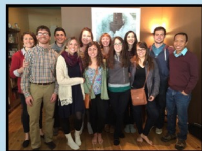
Germany & Russia (p.2)