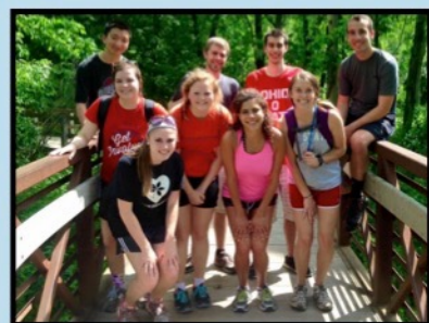
Summer Team (p.3)